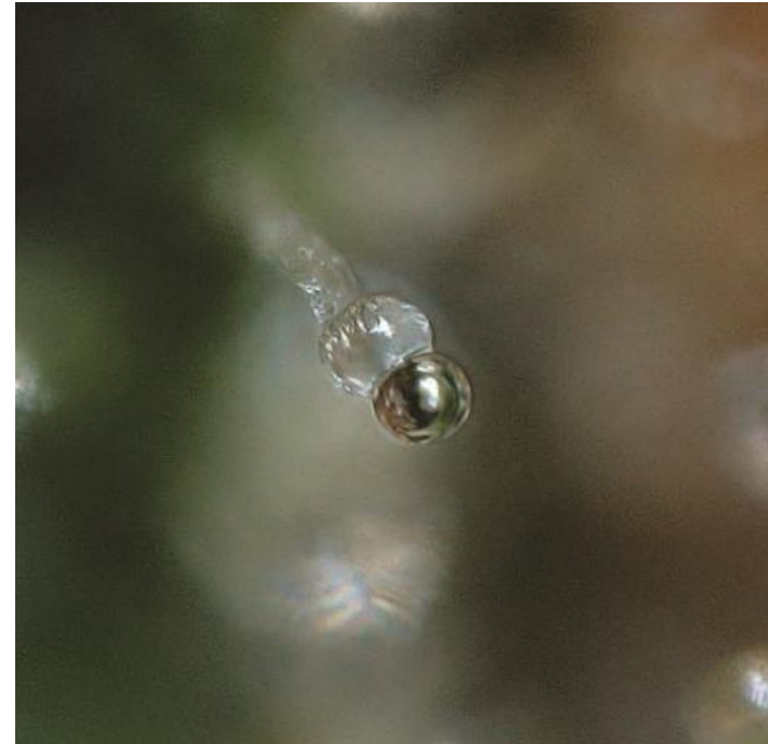
60/60 Traditional HVAC/Dehu 20-30% Damage