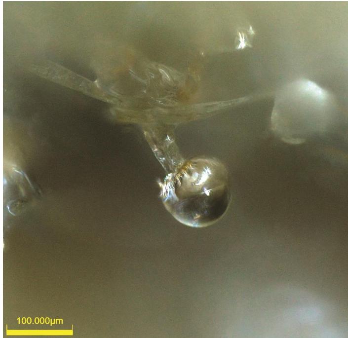
68/54 – Steady VP 1-2% Damage