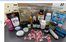
Table 2. Types of cannabis and hemp samples that can be analyzed by the AOAC ICP-MS method. The samples in bold italics were used in the spiking study.